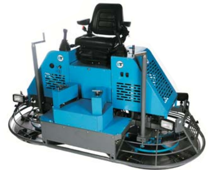
BT120H - 2/5/PFY44 - 46"