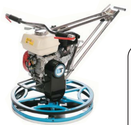
BT424 Edger Trowel Incorporating folding mechanism as standard.